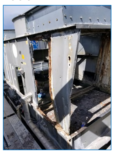
After Sheet Metal Repair